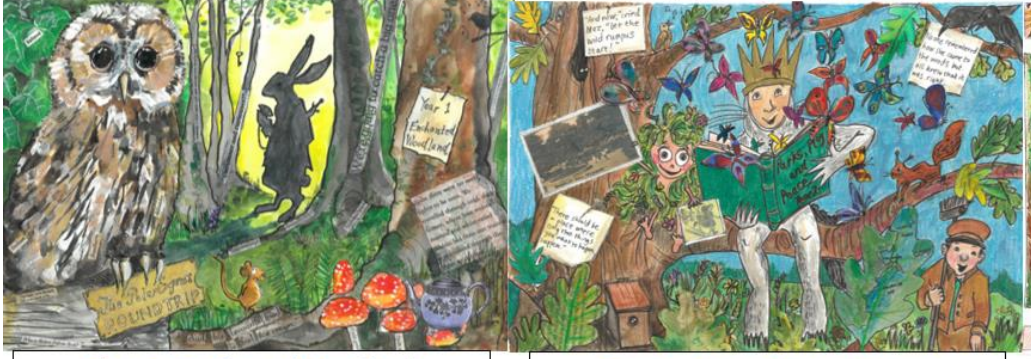
Class 1 – Enchanted Woodland Plants, seasons, settings and stories

Marlborough School's Illustrated Curriculum Autumn Term 2021