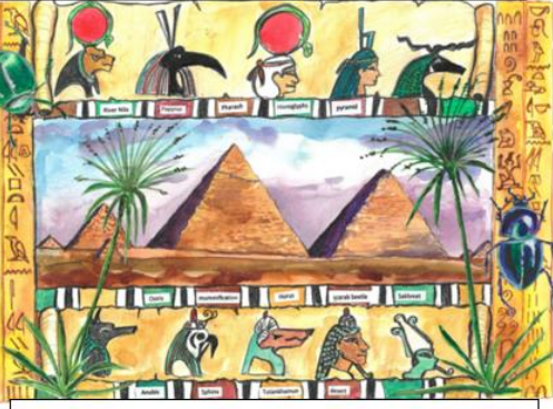
Class 4 – Ancient Egypt Tales of Mummies, Gods and Pharaohs