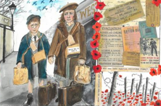
Class 6 – Bombs, Battles and Bravery The History of World War 2