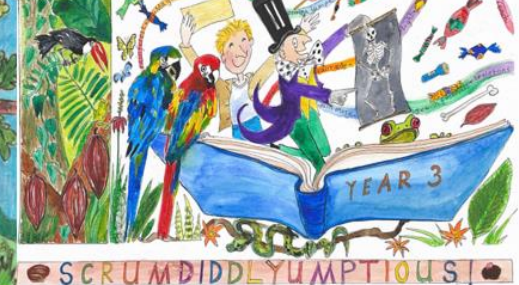
Class 3 – Scrumdiddlyumptious Roald Dahl and the history of chocolate