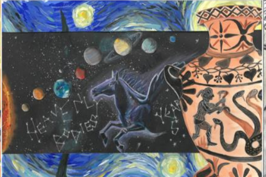
Class 5 – Heavenly Bodies Ancient Greece and Outer Space