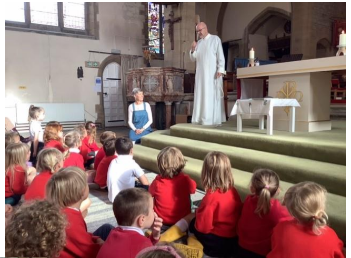
All Saints' Church Visit