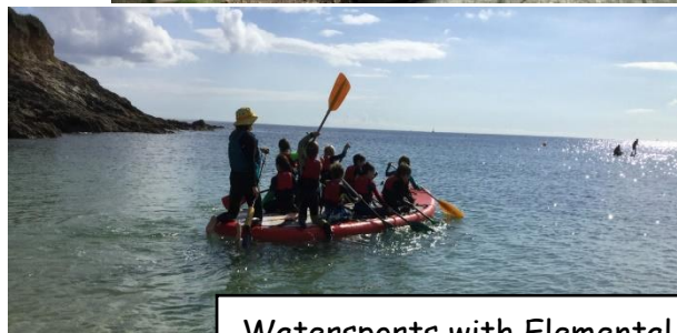
Watersports with Elemental