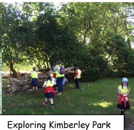
Exploring Kimberley Park