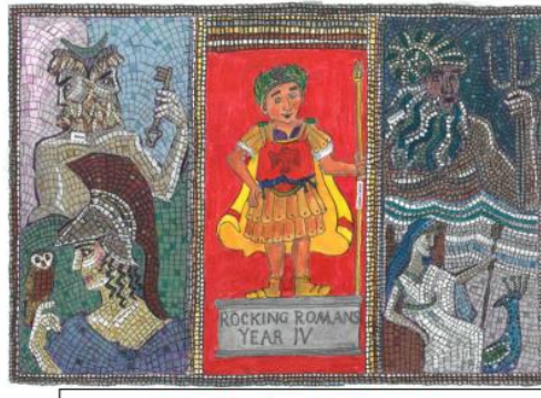
Class 4 – Rocking Romans Ancient times, myths and invasions

Class 3 – The Street Beneath Our Feet The stone age, rocks and geology