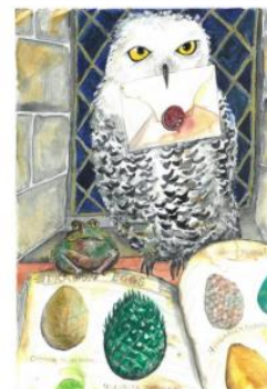
Class 6 – Adventures Harry Potter, medicine and futures

http://www.marlborough.cornwall.sch.uk/website