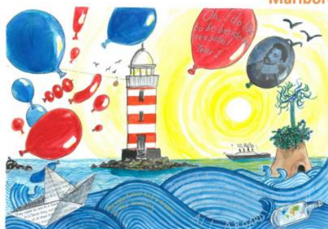
Class 1 – Oh, I do like to be beside the seaside! Flum Flum trees, lighthouses and holidays