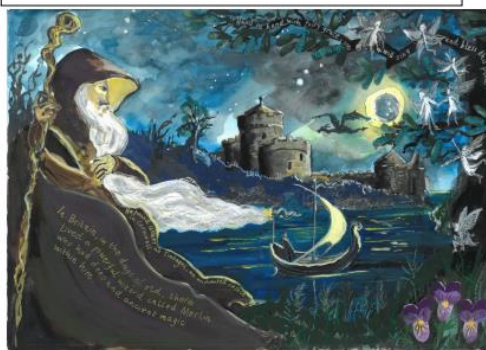
Class 4 – Castles and Rivers A journey through Cornwall