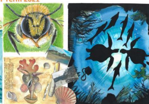
Class 3 – Sea Monsters and Plant Hunters Wildlife, art and beaches