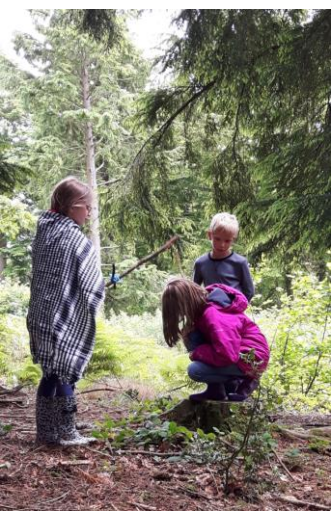
Image are returning next year with a re-telling of the Jungle Book – I wonder if we'll need to call on Idless to provide a rainforest backdrop!