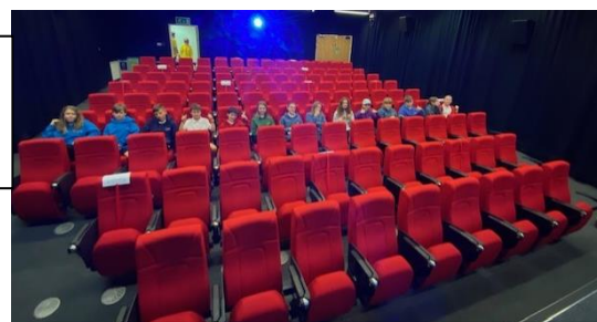
A fantastic day looking at Falmouth University's facilities.