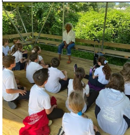
Gillian Burke, Springwatch presenter and wildlife expert