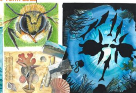
Class 3 – Sea Monsters and Plant Hunters Wildlife, art and beaches