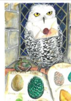
Class 6 – Adventures Harry Potter, London and futures