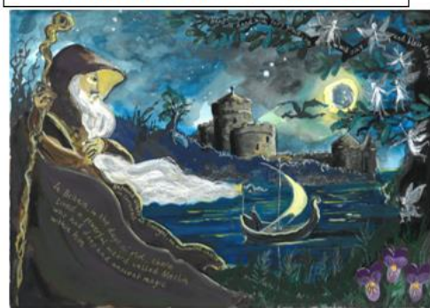
Class 4 – Castles and Rivers A journey through Cornwall