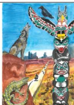
Class 5 – Stars and Stripes A road trip through the USA